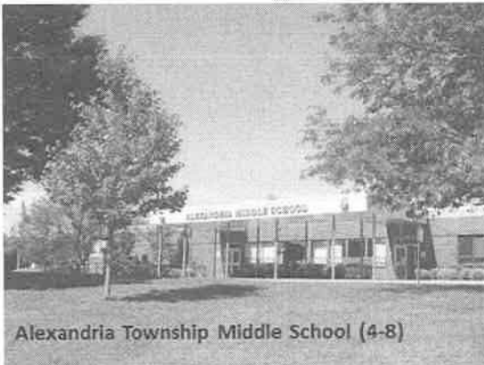
Alexandria Township Middle School (4-8)