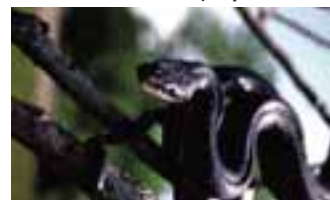
Adult above; Juvenile below