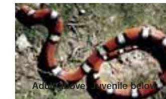
Adult above, juvenile below