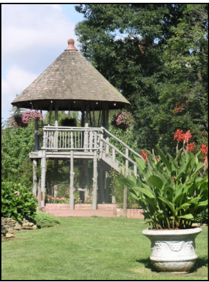
Two-story Gazebo at the Arboretum

Modification Statement: The Hunterdon County Division of Parks and Recreation welcomes all individuals to participate and enjoy our parks, facilities, and recreational programs. Reasonable modifications, individual adaptations, and support will be provided for persons of all abilities, to encourage everyone to benefit equally from their choice of leisure activities. Individuals requesting modifications shall describe what they need to use the service. Whenever feasible, please make the request in advance, before the modification is needed to access the service. Each request will be assessed individually.